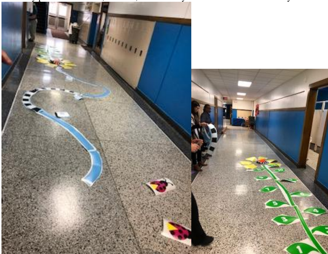
Left: Picture of a path laid out on floor Right: Flower/Petal path with numbers laid out on floor

Our sensory path will be a fun, creative, colorful way for students to build sensory connections!