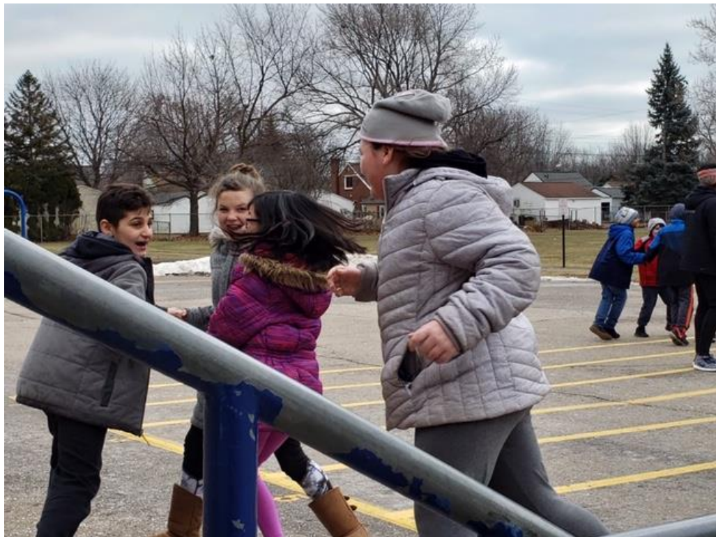
Students running and playing tag during PLAYWORKS!