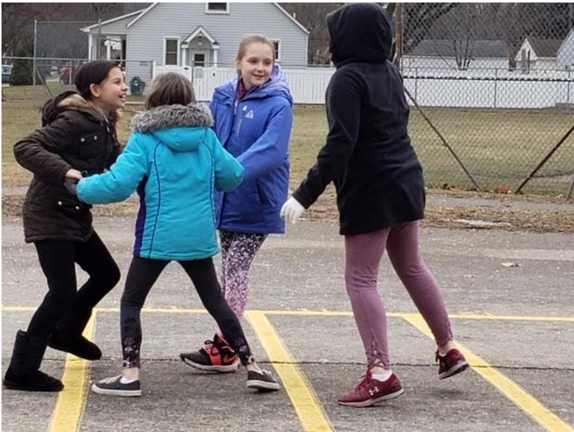
More PLAYWORKS games; 3 students holding hands while another looks to tag!