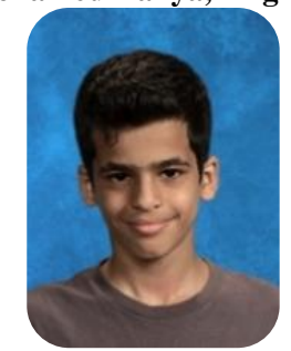
"We can't keep hiding from the truth and let it take us by surprise!"