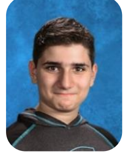
"A goal without a plan is just a wish!"