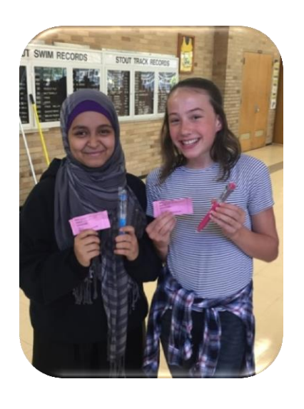
Some Dates to Remember