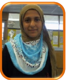
6 th Grade