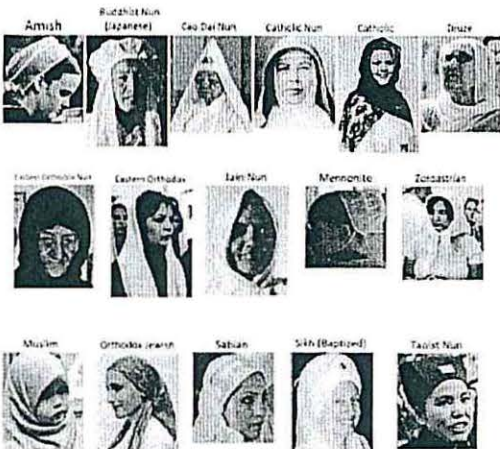
Women's Head Coverings By Different Religions

The head covering isn't exclusive to Muslim Women. As you can see in the picture on the side, many religions have a designated head covering for women. Actually, the literal translation of the Arabic term "hijab" is "cover," which means that any of the head covers in the picture on the left can be called a hijab. As a matter of fact, any modest (loose, unrevealing, and long) clothing can be considered a hijab.