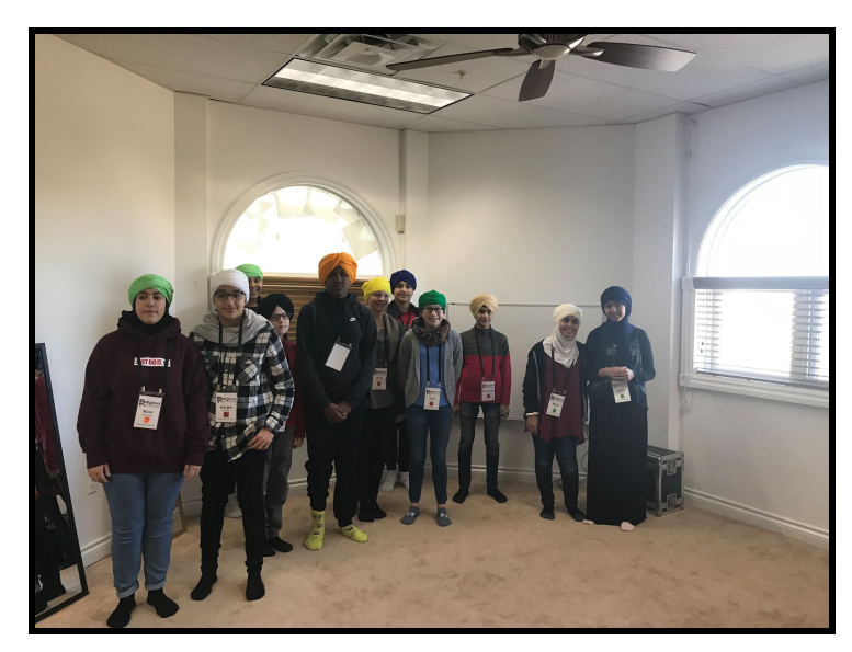
Religious Diversity 7th Grade Trip To a Sikh Temple