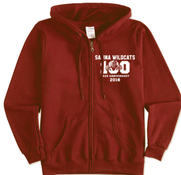
C. ZIPPER HOODIE IN MAROON, BLACK OR SPORT GREY W/ WHITE PRINT (FRONT VIEW) STUDENT $33.00