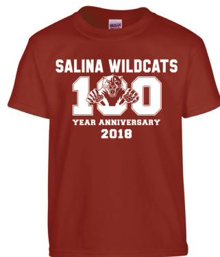
A. SHORT SLEEVE T-SHIRT IN MAROON, BLACK OR SPORT GREY W/ WHITE PRINT $12.00