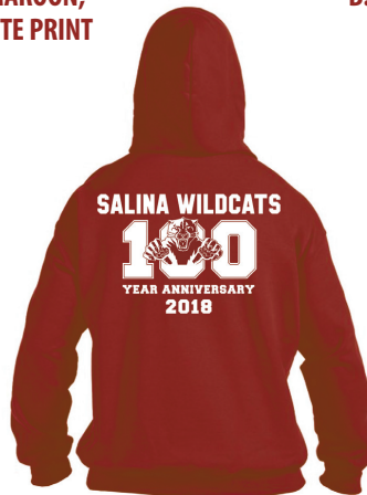
C. ZIPPER HOODIE IN MAROON, BLACK OR SPORT GREY W/ WHITE PRINT (BACK VIEW) ADULT $35.00