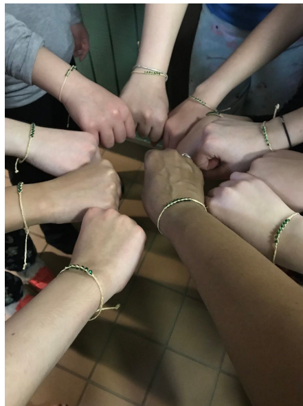
Teamwork Makes The Dream Work at Mc-U!