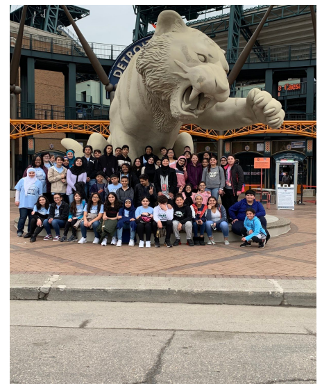
Students at Comerica Park