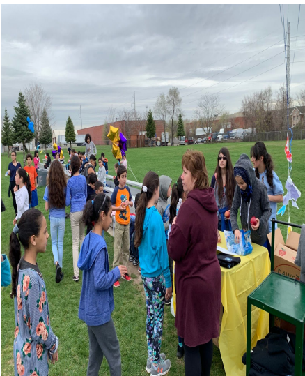
Blue Hands United Autism Charity Walk

Pictures were taken of McUnis activities in 2019(pre-pandemic)