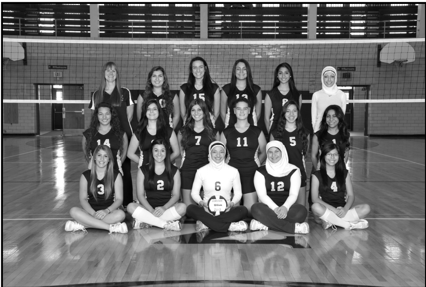
Fordson's Varsity Volleyball Team enjoyed success on and off the court this year. They defeated Robichaud and Crestwood (crossover teams) in 3 sets each. They also participated in team building activities throughout the year. A canoeing trip and attending the MSU Big Ten opener were two of the main activities they enjoyed off the court.