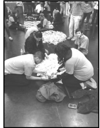
Key Clubbers shine again! On November 16th Key Clubbers attended the Fall Rally in Wayland, Michigan. This year's theme was "The Evolution of Service."

Thursday: Students wore their Key Club shirts with pride!