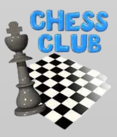
Bryant Virtual Chess Club Ready for a game changer!

With the Covid-19 preventing in person chess clubs, Bryant School will now offer a virtual after school Chess club.