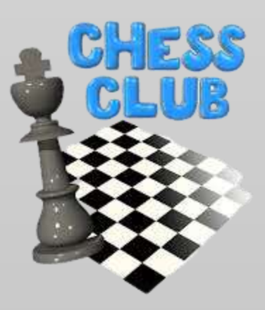
Bryant Virtual Chess Club Ready for a game changer!

With the Covid-19 preventing in person chess clubs, Bryant School will now offer a virtual after school Chess club.