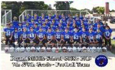
Legend Middle School - Football Team

Please have order form completed prior to your picture date (Date to be Determined, Coach will notify you)